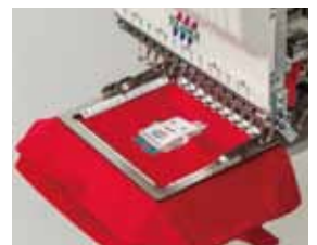
▲Air type Clamp