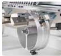
Reinforced Wide Cap Frame